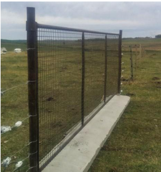
Gate with concrete threshold

Gates can be the weak point in a predator resistant fence. Gates should be the same height as the surrounding fence and provide a tight fit to the fence. An electric wire can be included on top, or the entire gate can be electrified. One option for 9-wire and 11-wire fences is to extend the wires across the gate opening and using insulated handles to connect and disconnect them as needed. Burrowing under the gate should be deterred by installing a wire net apron underneath and extending out from it or another barrier such as concrete threshold.