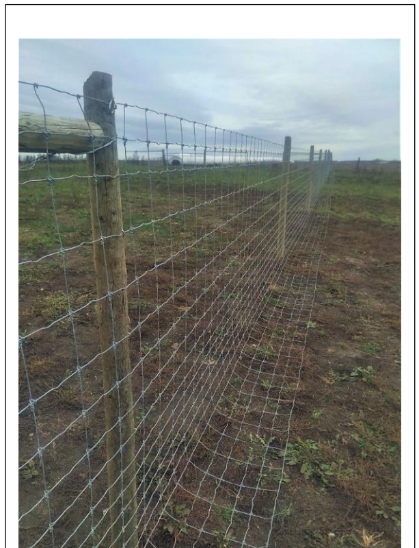
Fixed-knot fence with apron to deter burrowing

It is highly recommended that a minimum of one strand of electrified wire be added to the top of the woven wire fence to prevent animals from climbing over. Even better, would be to have two hot wires at the top, with a ground wire between them. These should be spaced at a maximum of 15 cm (6") apart. Electric wires can be used to increase the effective height of the fence and discourage climbing. Electric wires can be used in this manner with 48" wire-net fencing to create an effective barrier. Coyotes are particularly agile and are known to cross over 1.52 m (60") high fences.