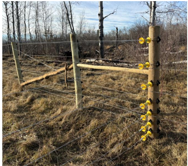
Electrified gateway using insulated handles to connect the gateway wires to rest of the fence.